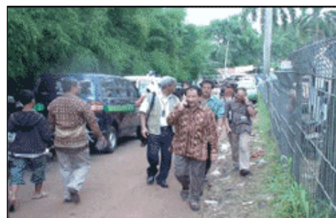
Rapid health assessment conducted by Crisis Centre & EHA-WHO Team.