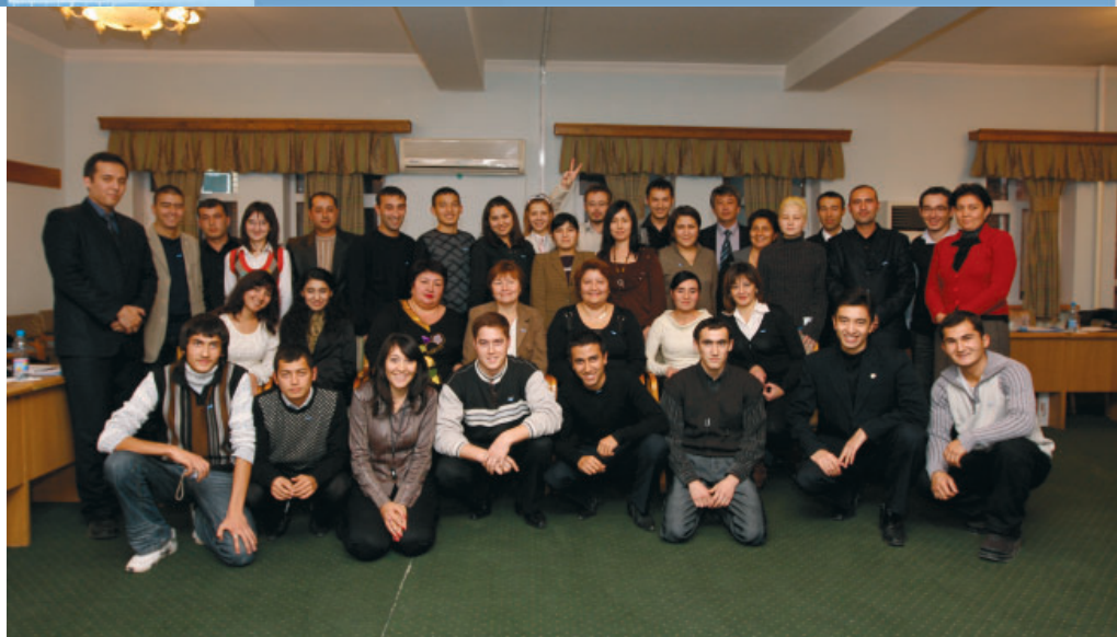
Uzbek volunteers unite for development on Volunteer Day