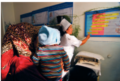
Training is key. For both Doctors and families, new knowledge and skills gained through the programme means higher quality care for kids.